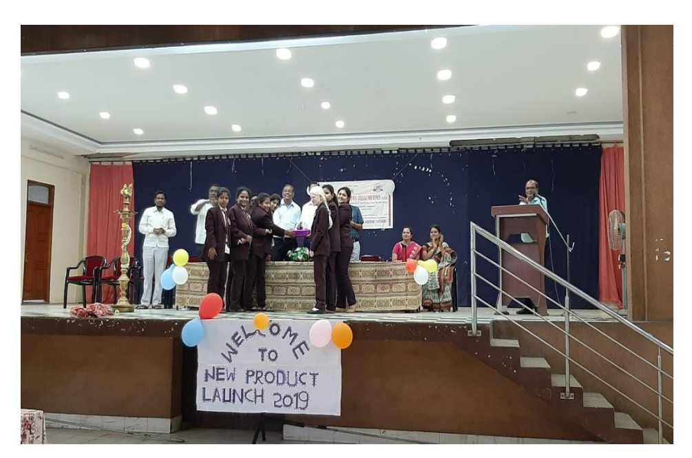
Third prize winners shared \, by M.com III sem And BBA V Sem