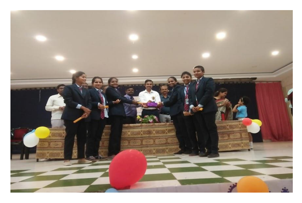
Second prize winners BBA V SEM